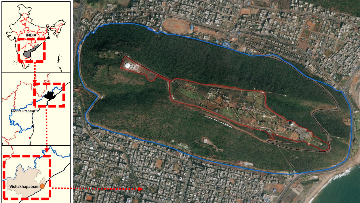
Figure 1. Location Map of Kailasagiri Hill Park